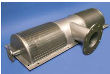
Johnson Screens® Half Intake Screen

As water demands increase for cities, towns and industry, shallow water resources previously hard to withdraw from due to their lack of depth, have become a more viable option.