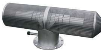
Max-Flow™ Passive Intake Screen

Johnson Screens' next generation Passive Intakes with the Max-Flow™ design increase the flow capacity of the previous designs by up to 40%. The newly redesigned internal modifier allows an even slot velocity distribution also along the extended screening surface in the screen central area. The new