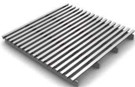
Picture on the right: Johnson Screens® Passive Intake Screen Z-Alloy (CuNi) to avoid zebra mussel growth